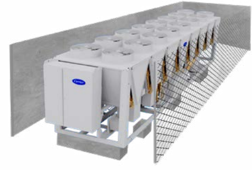
A chiller between chain-link and solid walls