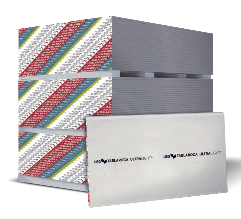
Table 2. Product system of USG gypsum boards